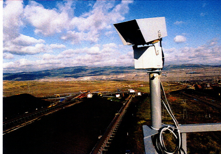
The FLIR Systems ThermoVision™ infrared camera mounted on a mast over the coal piles of the Nástup Mines Cooperation in the Czech Republic.

this critical task. Only a fully automated system is able to constantly monitor the hundreds of thousands of tons of coal which are stored at this site on an area of approximately 800 x 200 meters.