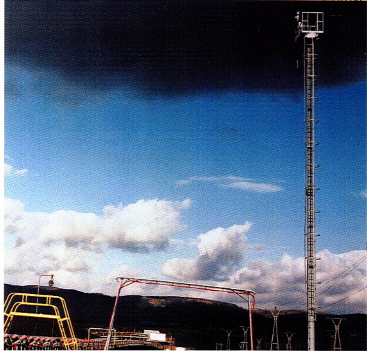
Continuous combustion detection to prevent spontaneous fires with a surveying ThermoVision™ by FLIR Systems

Safety of course means not only protecting the stored materials themselves, but also ensuring the safety of employees and others in the areas around the storage sites. In addition to that, there is also the risk of consequential damage that can be caused by fires, including loss of property, water damage resulting from fire-fighting and standstill of production lines. In view of these real risks, the cost of an automated temperature monitoring system using infrared cameras is a modest and very worthwhile investment.