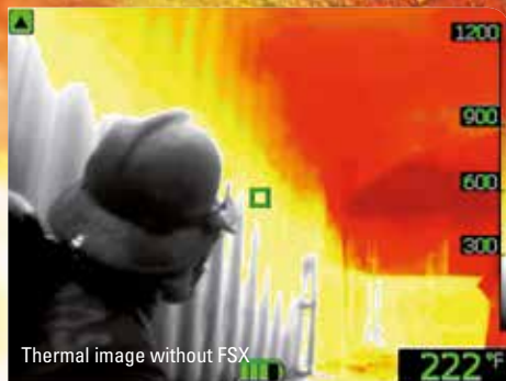
Thermal image without FSX

National Fire Protection Association and NFPA are registered trademarks of the National Fire Protection Association. The NFPA does not test, certify or approve any products.