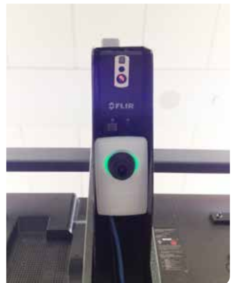
When an object whose temperature is above a certain threshold passes under the camera, the image is recorded. Then, a shape detection system analyzes the recorded image.