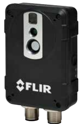
The FLIR AX8 is a small, affordable thermal sensor that provides continuous temperature monitoring and alarming capabilities to protect critical equipment.

The anti-intrusion system developed by ENGIE Services uses the FLIR AX8 thermal imaging camera to monitor the conveyor. When an object whose temperature is above a certain threshold passes under the camera, the image is recorded.