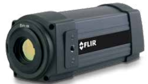
The FLIR A-320 thermal imaging camera.

Human routine inspections usually take into account main substations, isolators, switches, and other equipment, as well as the status of foreign matter within a substation. However, human inspection can be cumbersome, repetitive and monotonous, and